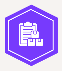
Al for Order Management, Field operations efficiency