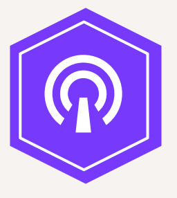
Al for air interface, Al for RAN, Al for Core