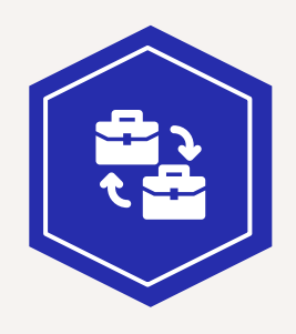
Al for B2C/B2B sales, Alpowered marketing